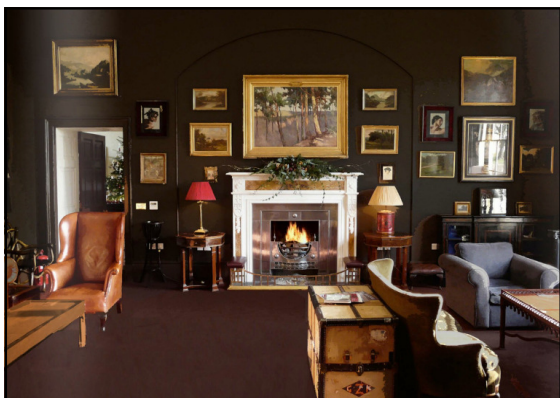
The Chocolate Bar

We are thrilled to invite you to our 2012 Summer Singing Retreat. Imagine spending a week, or just a day, away from the cares of the world, enjoying a luxurious country manor house, exploring your voice with some of the country's top vocal coaches, and singing with friends. With a variety of accommodation options, or the chance to come for a day, our Singing Retreat has something for everyone.