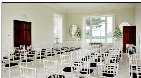
The Music Room